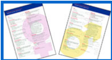
Self-Scoring Heart Test