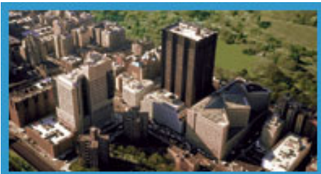
Mount Sinai Video